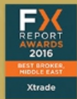
Forex Report Award

Our portfolios are careful selections of cryptoassets and hedge funds, and are tailored to match the investor's financial goal, whether it's long-term, mid-term, or short-term. Build a portfolio today and enjoy the best of both asset classes.